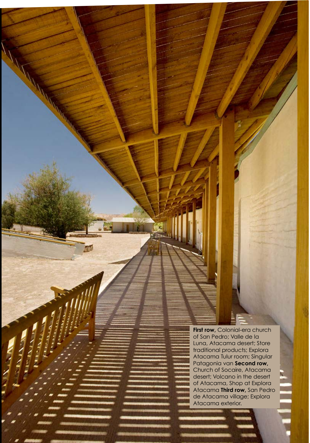
First row , Colonial-era church of San Pedro; Valle de la Luna, Atacama desert; Store traditional products; Explora Atacama Tulum room; Singular Patagonia van Second row , Church of Socaire, Atacama desert; Volcano in the desert of Atacama, Shop at Explora Atacama Third row , San Pedro de Atacama village; Explora Atacama exterior.