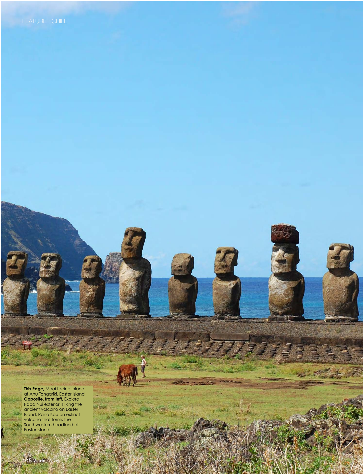
This Page, Moai facing inland at Ahu Tongariki, Easter Island Opposite, from left, Explora Rapa Nui exterior; Hiking the ancient volcano on Easter Island; Rano Kau an extinct volcano that forms the Southwestern headland of Easter Island