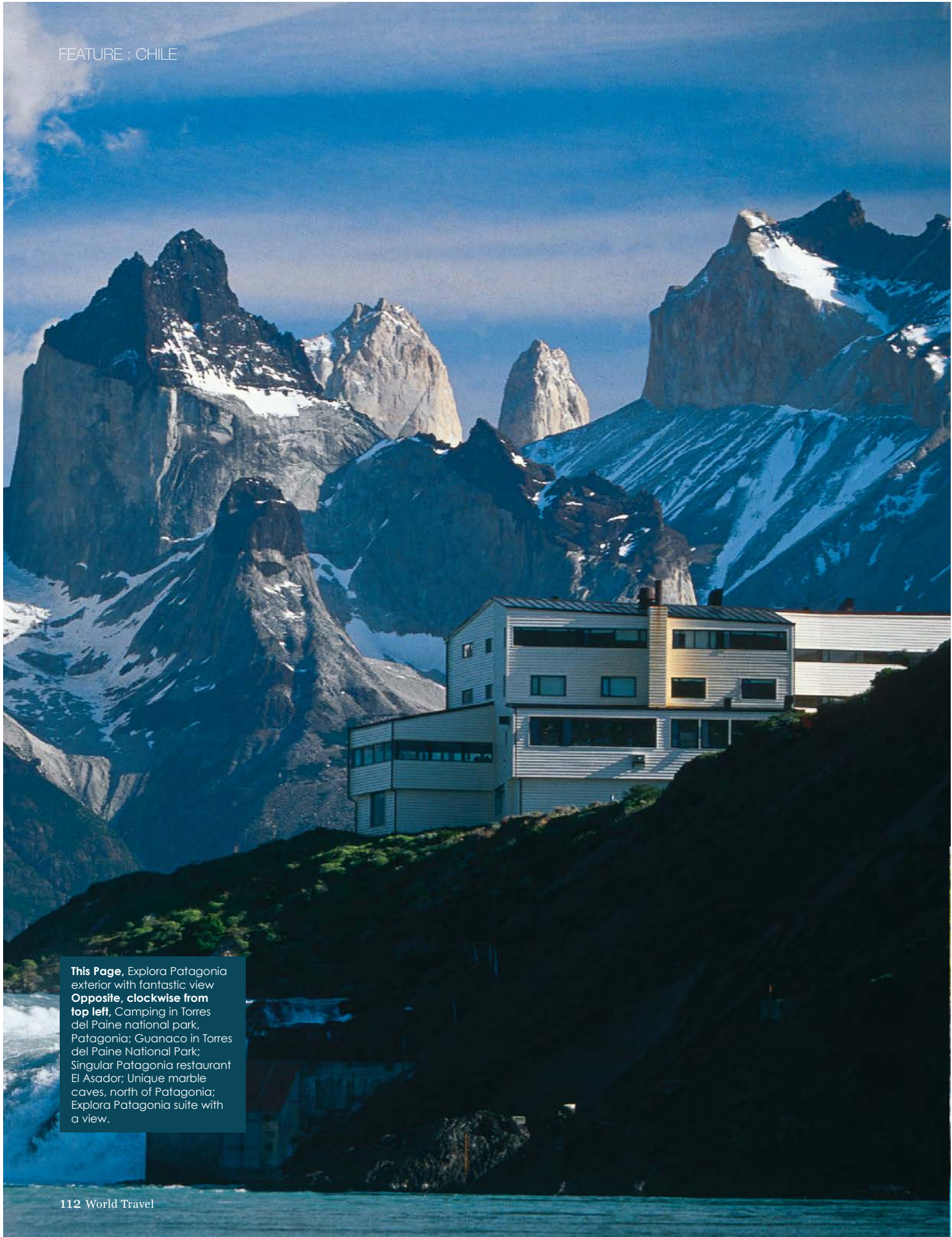
This Page , Explora Patagonia exterior with fantastic view Opposite, clockwise from top left , Camping in Torres del Paine national park, Patagonia; Guanaco in Torres del Paine National Park; Singular Patagonia restaurant El Asador; Unique marble caves, north of Patagonia; Explora Patagonia suite with a view.